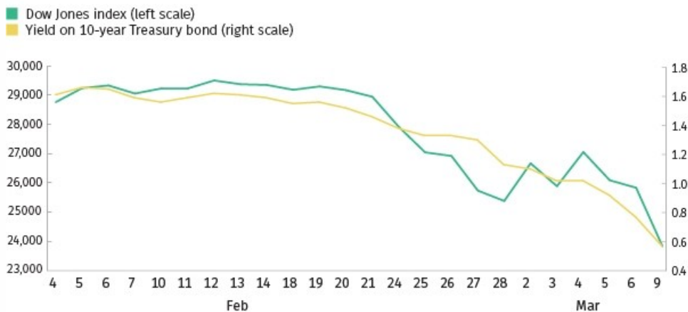
Figure 1 Financial Markets' Reaction to COVID-19