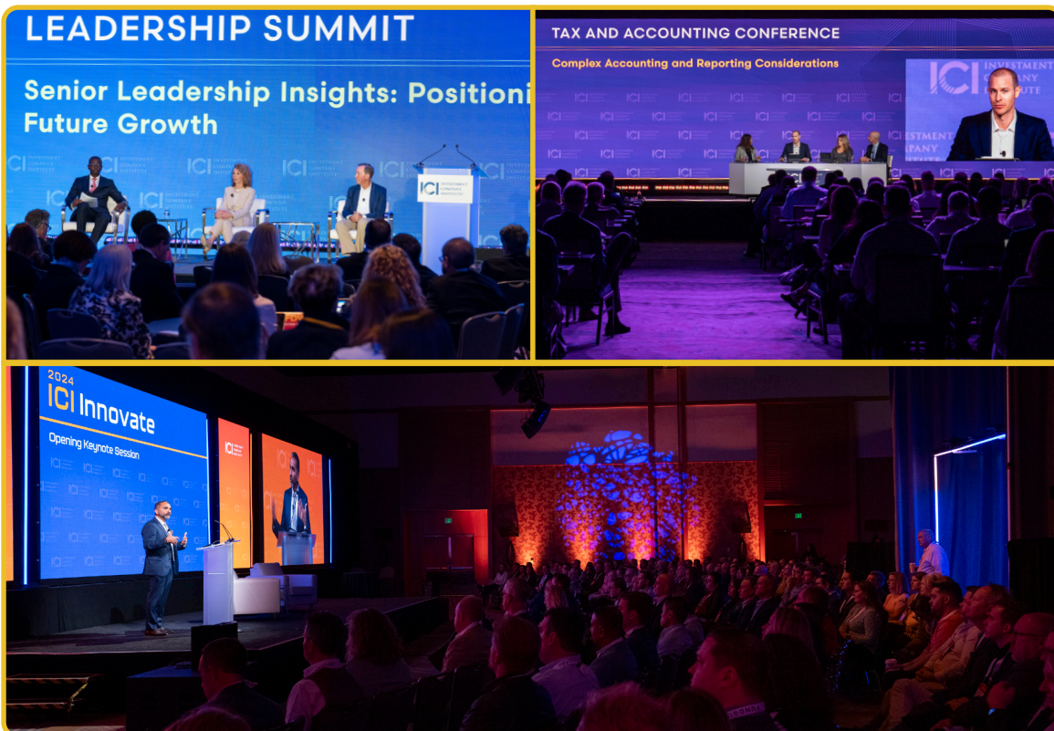
Photos from some of our recent events, which feature influential and insightful speakers, informative panels, and frequent opportunities to network.

ICI Mutual Insurance Company offers a variety of insurance products exclusively to ICI members. Founded by the fund industry, ICI Mutual is the leading provider of liability insurance and risk management services to funds and their directors, officers, and advisers, as well as insurance coverage tailored specifically to independent fund directors. With its unique access to leading experts in the fund industry, ICI Mutual has the financial strength, steady capacity, and consistent coverages to fulfill your firm's risk-financing needs. More information about products and services is available at www.icimutual.com .