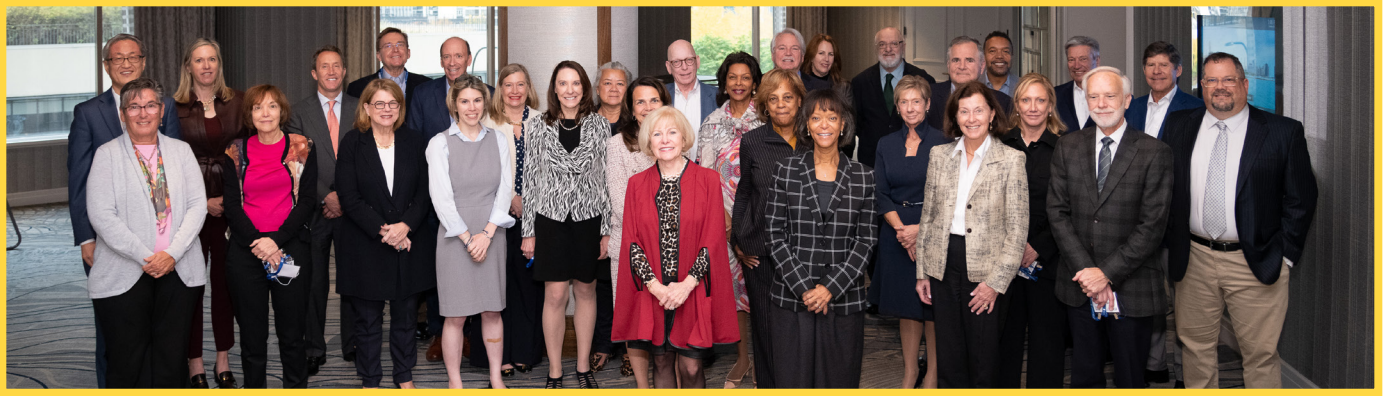
Members of the IDC Governing Council and Staff in Chicago.