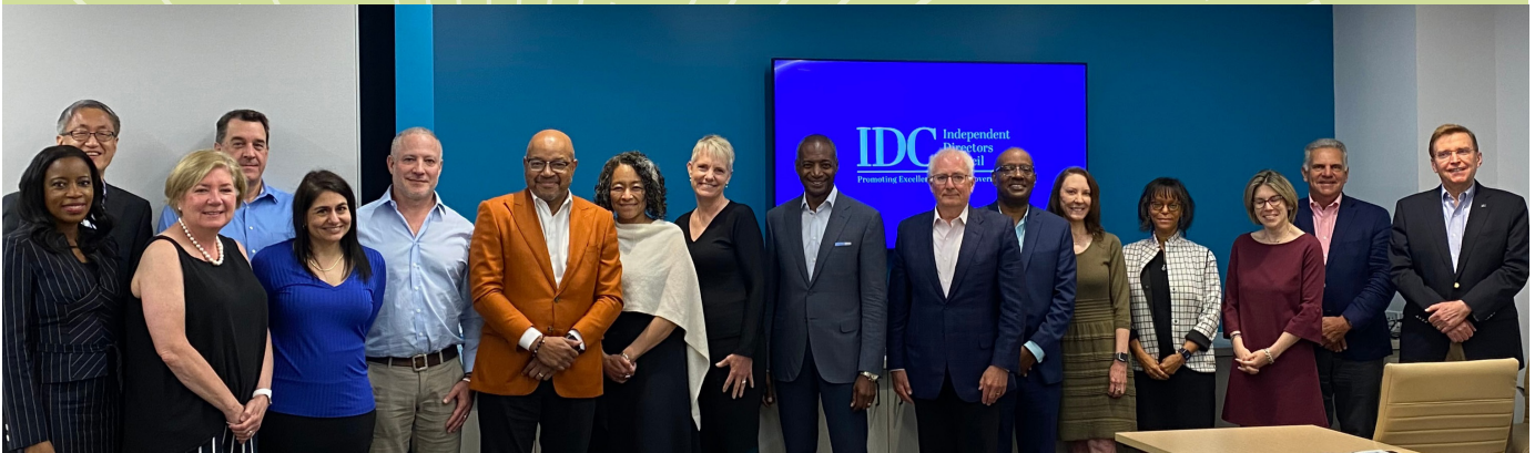
Participants in the Foundations ® program at the IDC offices in June 2022.

IDC's Foundations for Fund Directors ® gives newer directors the skills and a sound base of knowledge necessary to serve as stewards of shareholders' interests. IDC held two sessions in March and June, each featuring live instruction, case studies, and group discussions to develop participants' knowledge and skills regarding the fund industry, the structure and regulation of funds, fund governance principles, and fund directors' oversight responsibilities.