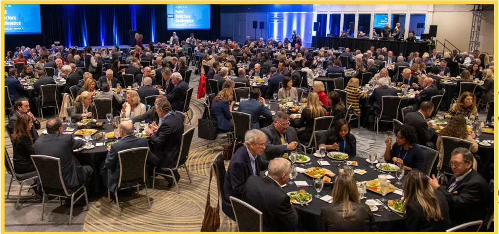
Gatherings and discussion sessions at IDC's Fund Directors Conference in Chicago.